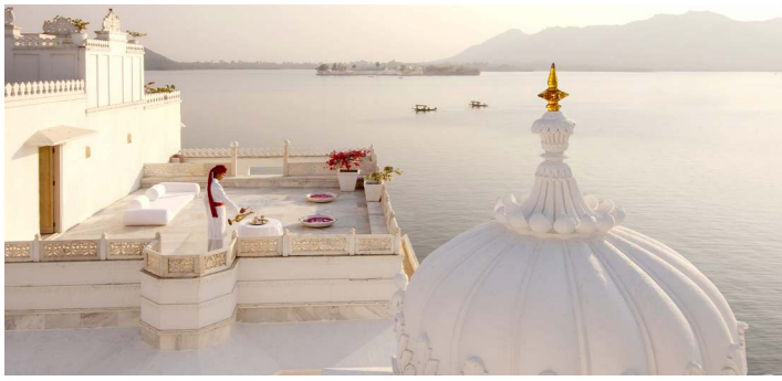
The Royal Butlers can create Magical Dining Moments