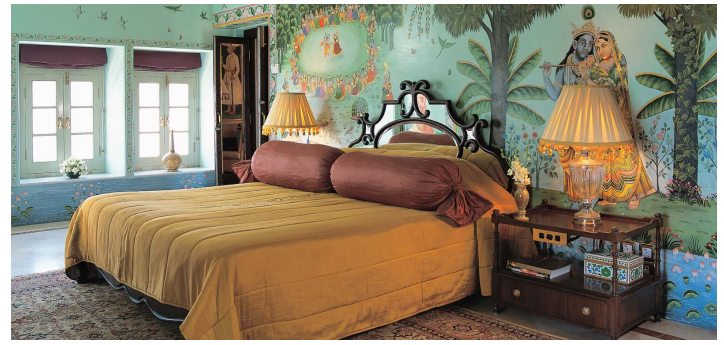
Sajjan Niwas Suite

• The Royal Butlers can create magical dining moments wherever you desire, be it within the luxury of your suite, a sit down dinner by the Lily Pond; a romantic dinner on the Mewar Terrace, dinner on the marigold decked royal barge or pontoon or a candle studded courtyard.