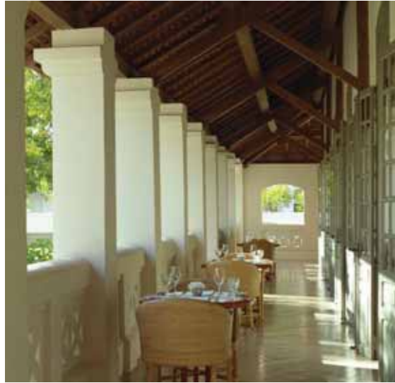
Amantaka celebrates the unique tastes of Luang Prabang with traditional Lao cuisine and contemporary French fare. The resort offers several dining venues – The Dining Room with its airy colonial ambience ( right ), the shady Veranda and the inviting open-air Pool Terrace.