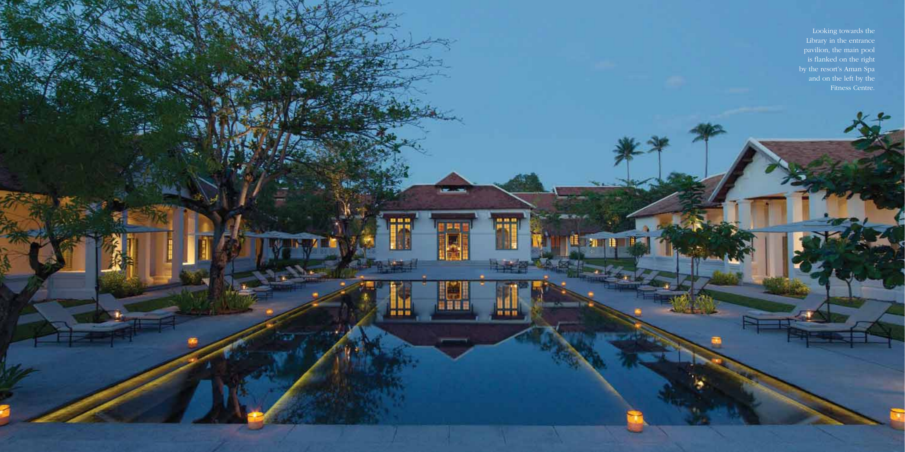
Looking towards the Library in the entrance pavilion, the main pool is flanked on the right by the resort's Aman Spa and on the left by the Fitness Centre.