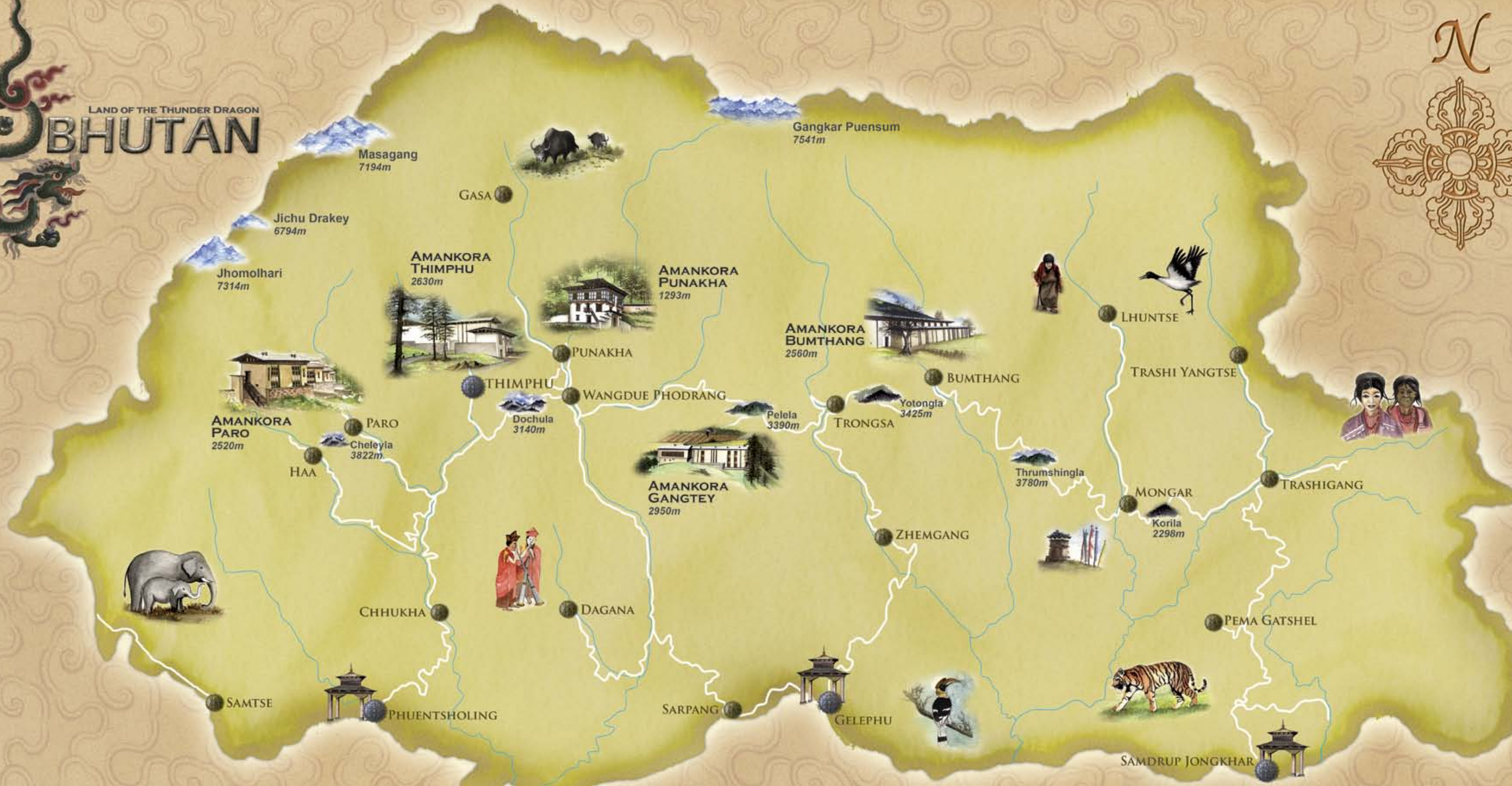
The Amankora Journey : Estimated Travelling Time (including short stops)