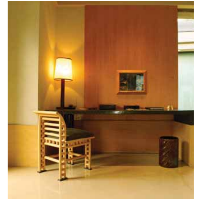
Each of Amanjiwo's suites features a four-pillar bed on a terrazzo platform, sungkai wood screens, coconut wood and rattan furniture, rawhide lamp shades, Javanese textiles and antique glass paintings.