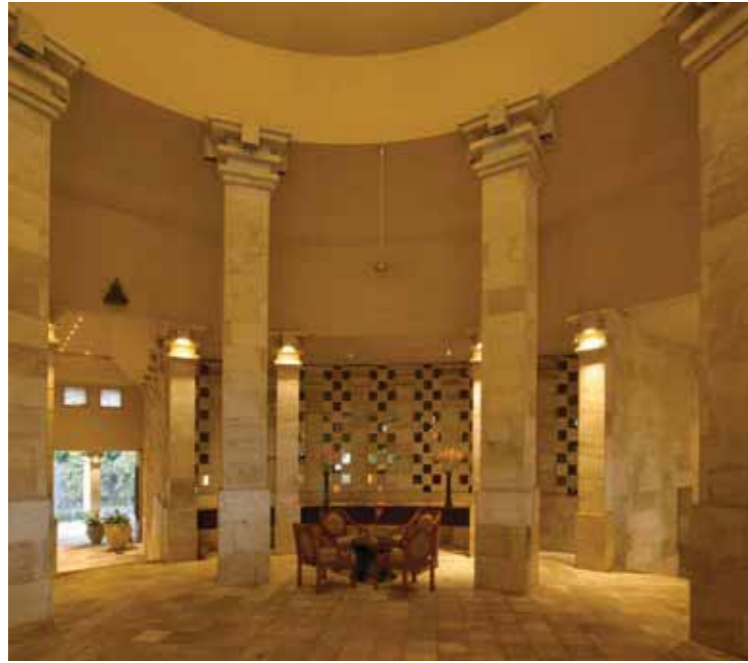
Amanjiwo's main structure is a circular limestone monolith centred by a soaring bell-shaped rotunda. The airy entranceway leads to the lofty-ceilinged Bar from which one can again see Borobudur in the distance.