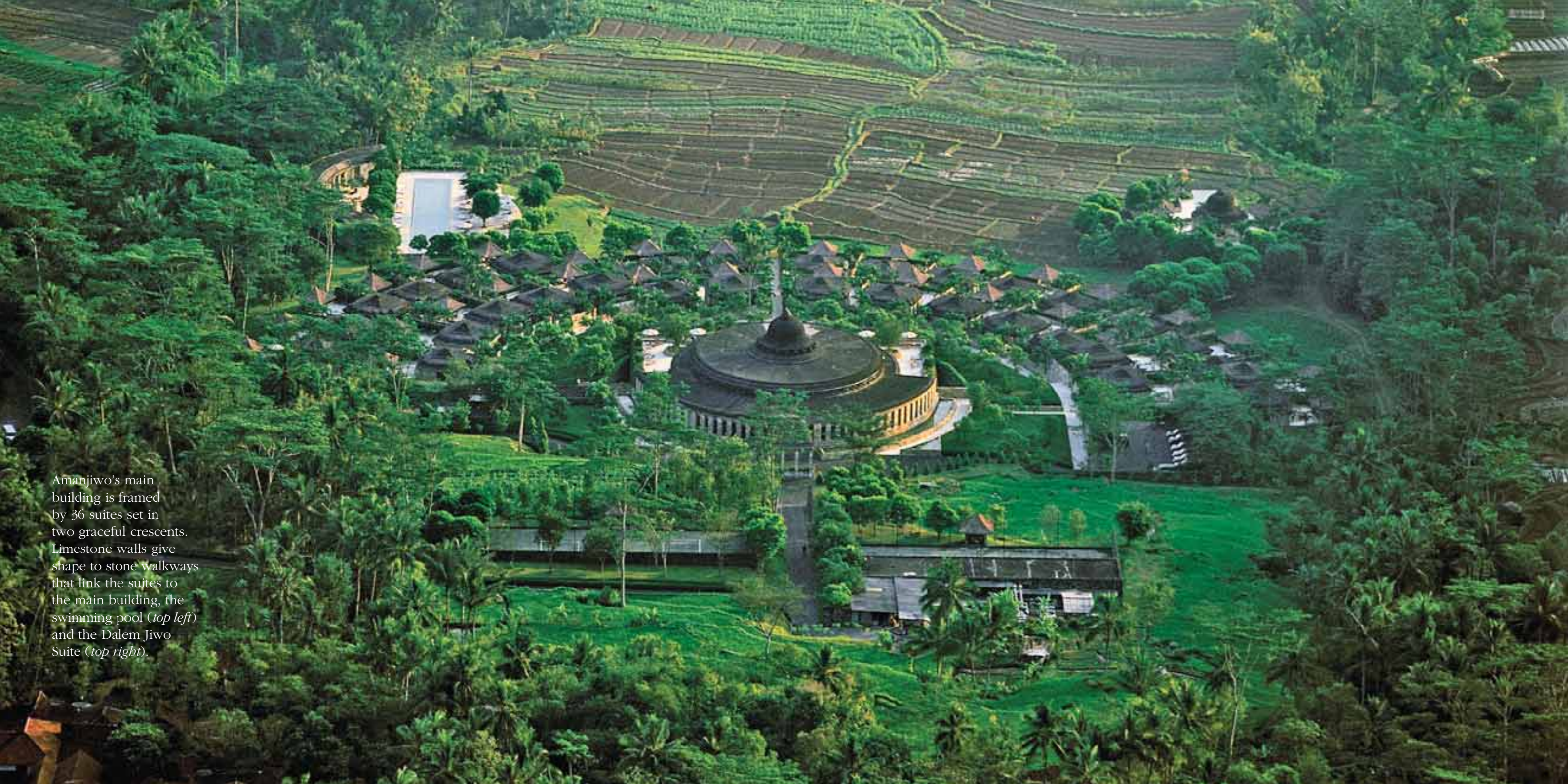
Amanjiwo's main building is framed by 36 suites set in two graceful crescents. Limestone walls give shape to stone walkways that link the suites to the main building, the swimming pool ( top left ) and the Dalem Jiwo Suite ( top right ).